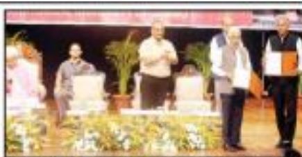
Director IIM Jammu and JU Vice-Chancellor displaying copies of MoU in presence of LG and Advisor.